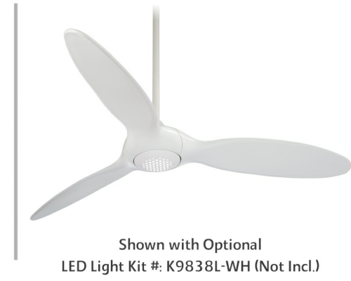
Shown with Optional LED Light Kit #: K9838L-WH (Not Incl)